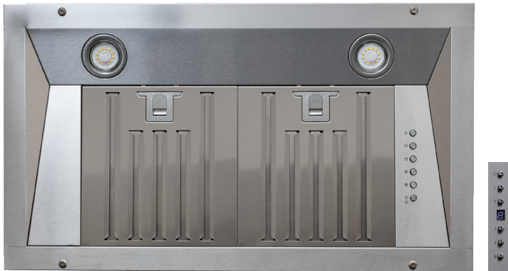
Included with the PLJL Classic: Push Buttons with LED Display for Easy Control