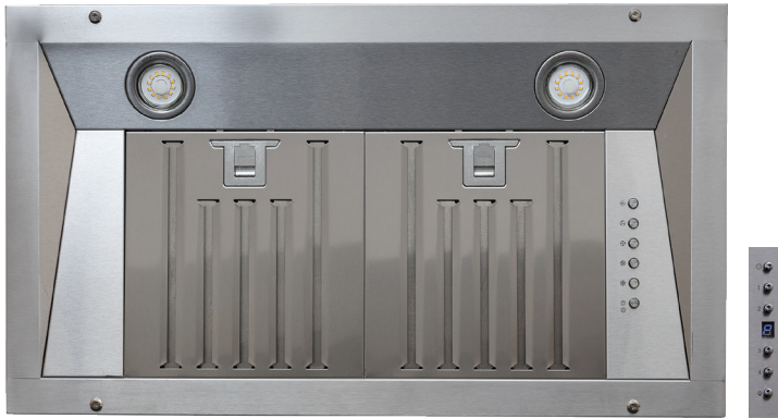
Included with the PLJL Classic: Push Buttons with LED Display for Easy Control